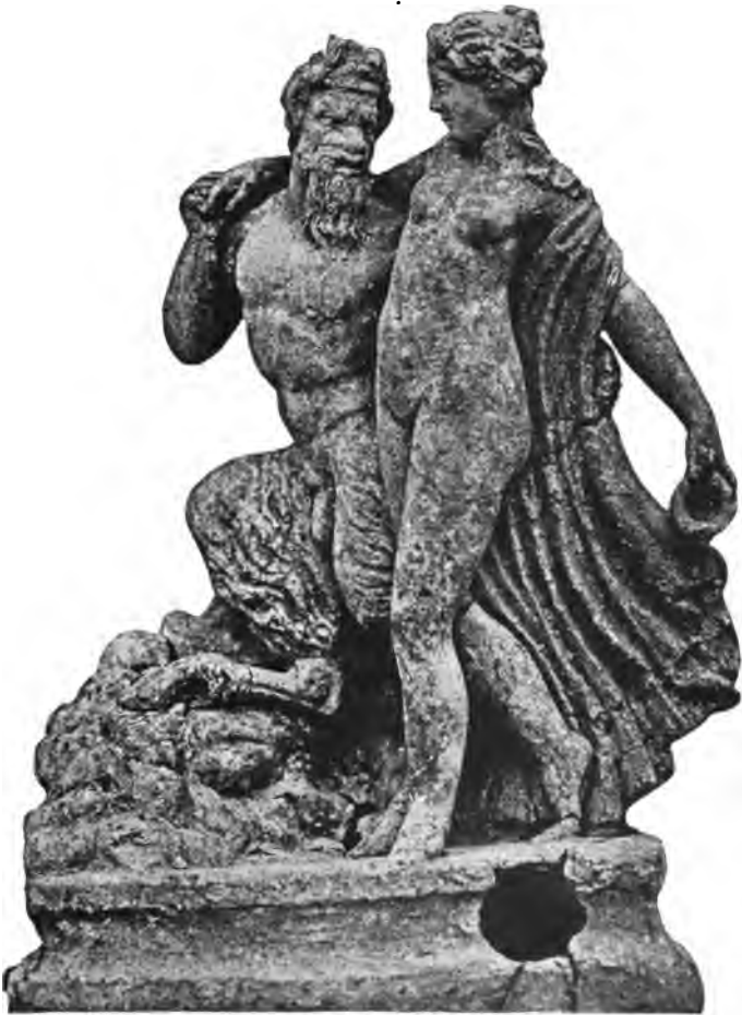
Fig. 51. Pan and a Nymph.